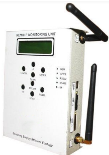
TrueChillers Monitoring Unit