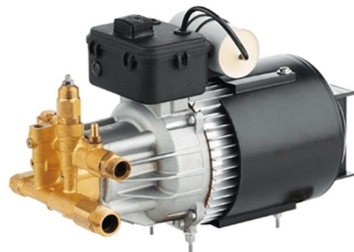
High Pressure Misting Pump