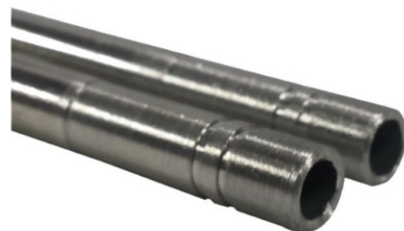
Tubes & Pipes