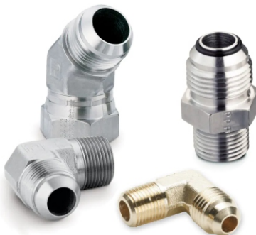
Fittings & Fasteners