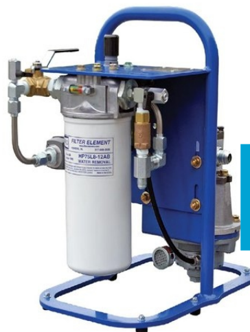
Water Filtration Unit