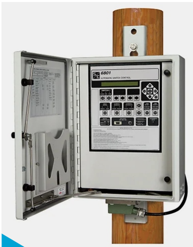
TrueChillers Automatic Control Unit