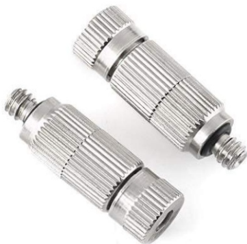
High Pressure Mist Nozzles